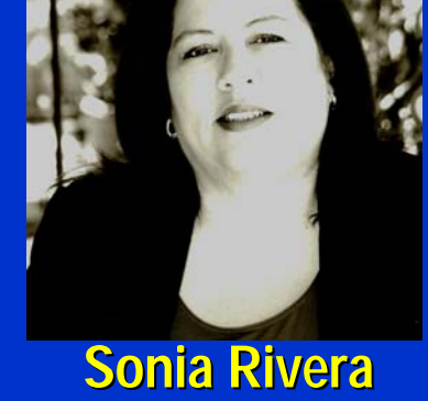
East Los Angeles Women's Center