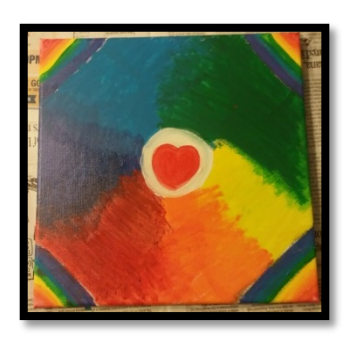
Staff art work with Ellen Bergan and Van Go Mobile Art Studio

Stone Belt or Indiana Coalition Against Domestic Violence) partners brought people from the community in to Stone Belt locations to explore the meaning of community and inclusion using paint, photography, and creative writing. No matter what the topic of the session, these works of art illustrate rich networks of support and love, but also deeply felt desires for more. Looking back, perhaps these activities should have been used early on to foster relationships and grow trust.