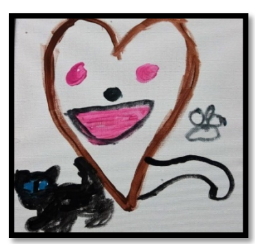
This heart was painted during an art session exploring the multiple meanings of community with Van Go Mobile Art Studio. The young blind woman who painted this shared that her pets help her to feel connected, like she belongs, and they also help her to cope with a loud world.

A theory of change serves the purpose of identifying long terms goals and requires mapping the necessary preconditions that must occur before that goal is met. Project planning from the outcome backward helps to identify appropriate programmatic approaches that are specific to the desired outcome. Rather than beginning a project with an evidence-based approach in which impact is tied to fidelity (meaning the program must be implemented in a specific way often by a