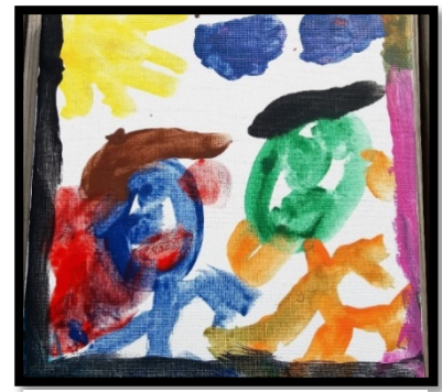
Date Night, painted January 28, 2017 by a young woman with disabilities who very much enjoys spending time with her boyfriend at restaurants eating their favorite food, pizza.

collaboration between community members, including people made vulnerable by health inequities, key decision makers and stakeholders across sectors and generations. The Bloomington Inclusion Collaborative project goal was to build community protections through increasing inclusion at the individual, organizational and community