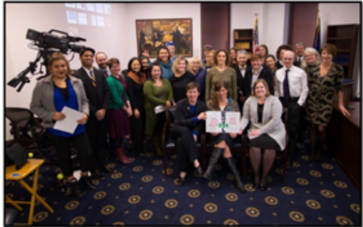
A legislative lunch signifying the 9th anniversary of the Lilly Ledbetter Fair Pay Act.