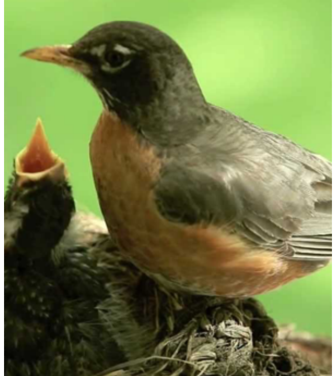
Ignacio compares holistic sexuality information to a mama bird feeding her baby birds: adults have a responsibility to consume and digest knowledge and feed it to youth in ways that nourish them and support their growth.

Historical trauma also intersects with and amplifies systems of oppression to impact the contemporary. In order to heal and to envision prevention within an equity lens, Strong Oak discusses the value re-indigenizing processes have on community-led efforts. Re-indigenizing is inclusive of many indigenous cultures and gives communities space to build a foundation of equity and respect for all beings and the environment that supports them.