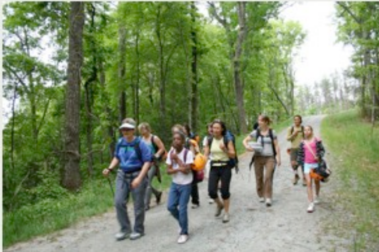
Strengthening Individual Knowledge & Skills