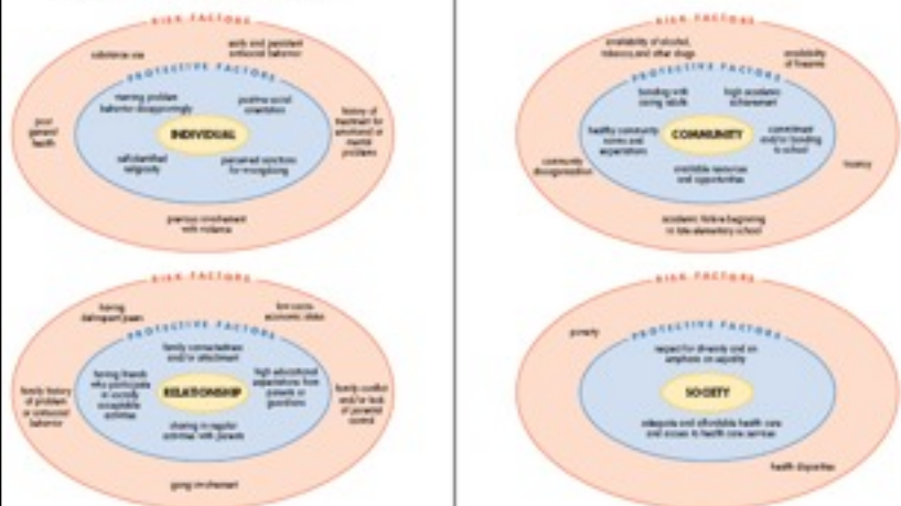
THE SHARED RISK AND PROTECTIVE FACTORS