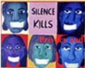
Privacy and Silence