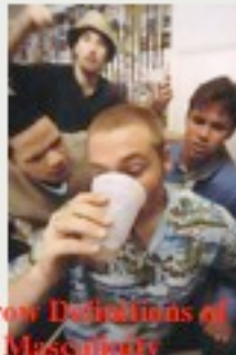
Narrow Definitions of Masculinity