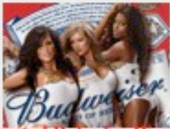
Limited Roles for Women