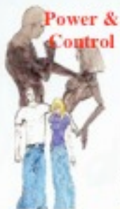
Power & Control