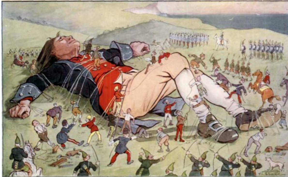
HE FOUND THAT HIS ARMS AND LEGS WERE TIGHTLY FASTFNED TO THE GROUND.