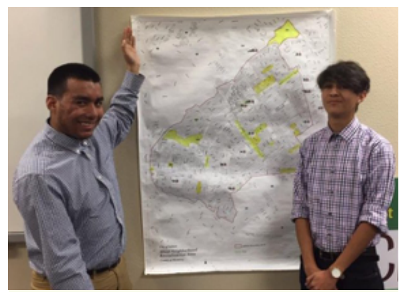
Two youth interns present a map highlighting areas for improvement within the Alisal neighborhood.

After the public health department was awarded a STRYVE grant from the Centers for Disease Control and Prevention (CDC) to reduce violence affecting youth and improve community safety, they decided to pursue a key environmental design strategy called Crime Prevention through Environmental Design (CPTED). Recognizing the need for community involvement in this strategy, the Monterey County Health Department partnered with a local, community-driven initiative called Building Healthy Communities (BHC). CPTED combines changes to both the physical and social environments, such as greening and revitalizing public spaces to increase community connectedness and prevent crime and violence. This is a strategy that has become central to many of the