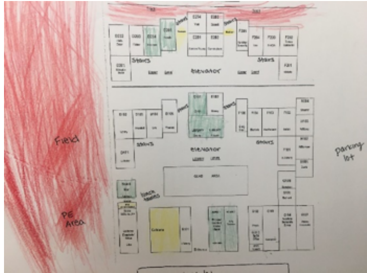
Students map out where they feel safe and unsafe in their school environment. Green=safe. Red=unsafe. Yellow = somewhat unsafe.

CDPH, Safequest Solano, and Center for Non Violent Community hope to expand the program to more schools in the future and continue to support the prevention of sexual harassment and precursors to dating violence through Shifting Boundaries.